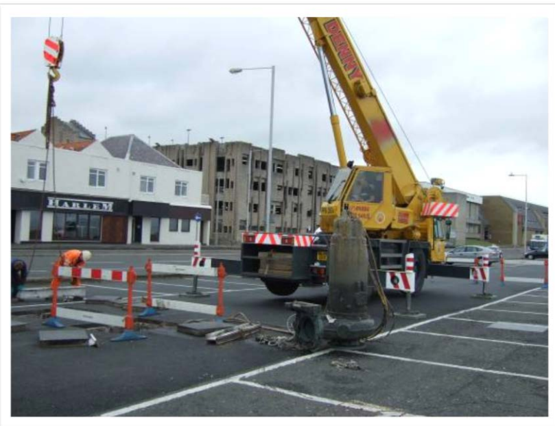
Pump lift and clean

During installation the wet well was thoroughly cleaned to determine the operating criteria of the pumps. This data was then used as the base line for monitoring all control conditions associated with the station. The condition of the SPS wet well was inspected by a Scottish Water team two months after the installation and it was found to be in a clean condition with no scum lines, grease or ragging visible.