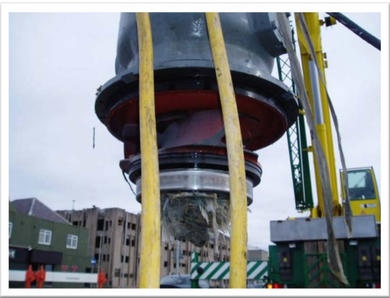
Typical Pump Blockage

The RPC_2000 was installed within the telemetry section of the station MCC panel. Telemetry signals were hard wired from the PLC and RPC_2000 to the RTU for onward transmission to the Scottish Water Open Enterprise telemetry monitoring network.